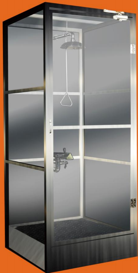
洗眼房 Eye washing room