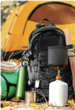
Sports & Outdoors