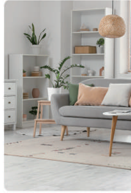
Home & Building