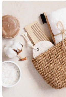
Beauty & Personal Care