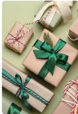
Gifts & Crafts