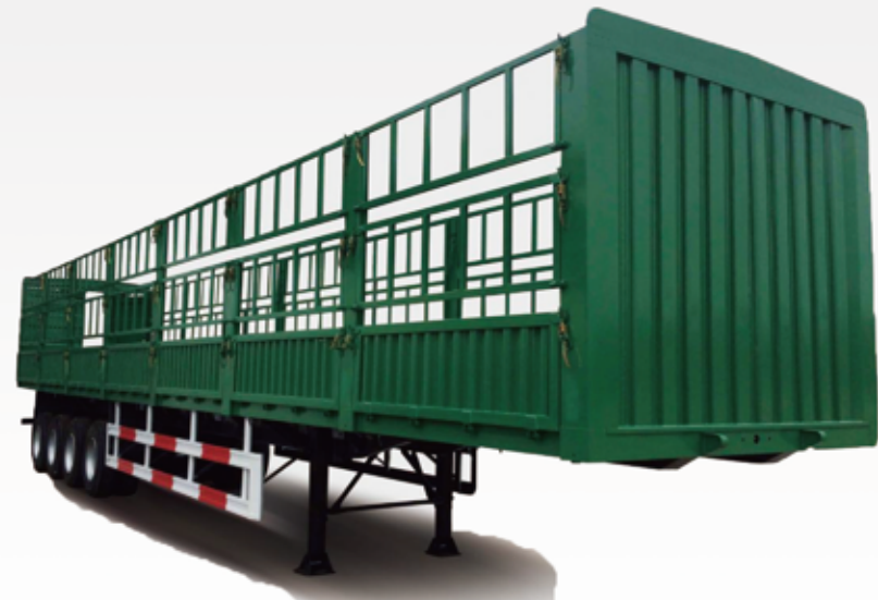
Fence Type Semi Trailer