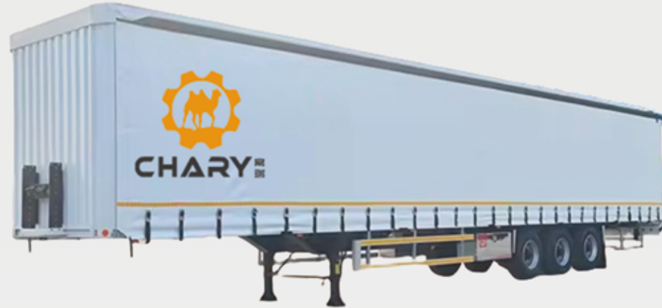
Curtain Semi Trailer