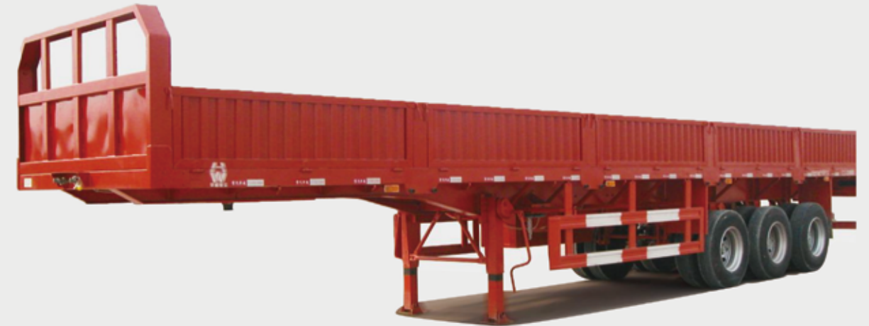
Flat Bed Semi Trailer