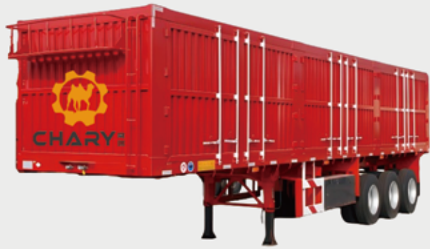
Van Semi Trailer